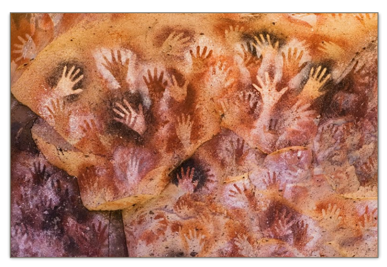
The Lament of the Dead: Ancestral Legacies, Fate and Destiny